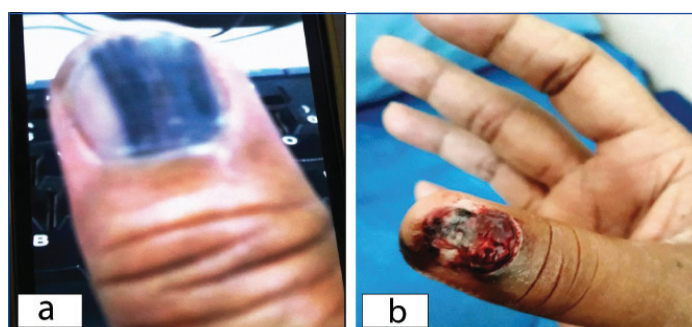
[Table/Fig-1]: a): Blackish linear discoloration of nail (clinical image of year 2011); b): Patient presenting with friable mass from the nail matrix with blackish discoloration extending to distal tip of thumb.

A 61-year-old male, stenographer by profession presented with chief complaint of a painful reddish mass in the nail matrix of the right thumb, associated with bleeding following a history of repeated trauma of three months with loosening of nail plate from the nail bed and a slowly growing mass with a increased tendency to bleed. The patient gave the history of a linear brown to blackish discolouration of the nail plate eight years back which was stored in his mobile camera [Table/Fig-1a]. The patient had been treated with antifungals and antibiotics for a long time on a clinical suspicion of Onychomycosis after eight years of the blackish discolouration of the nail, the patient presented with a fleshy reddish irregular mass measuring about 1 × 0.9 cm along with blackish pigmentation of the nail bed and tip of right thumb (Hutchinson's sign). The mass was friable and was bleeding easily on touch [Table/Fig-1b]. A surgical removal of the nail plate was done at our institute and a small biopsy from the mass was taken.